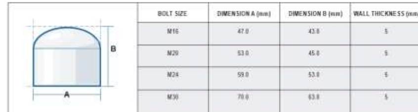
Imperial Bolt Cap overall dimensions